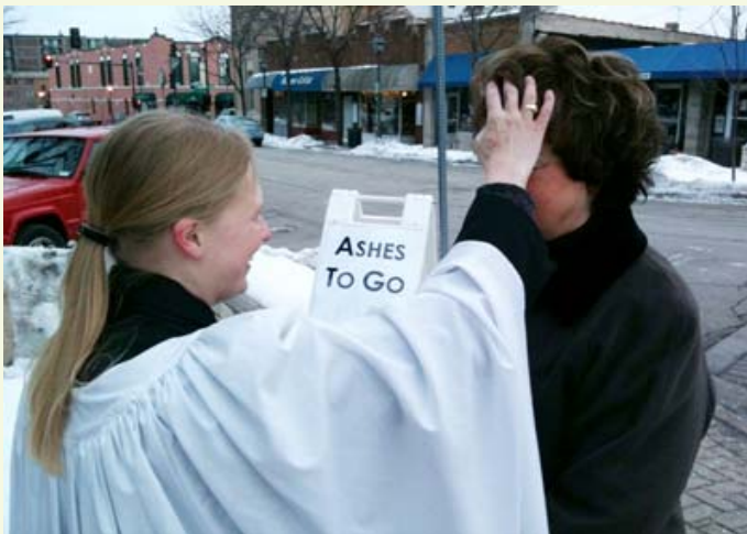
The Episcopal Church had higher than normal visibility on